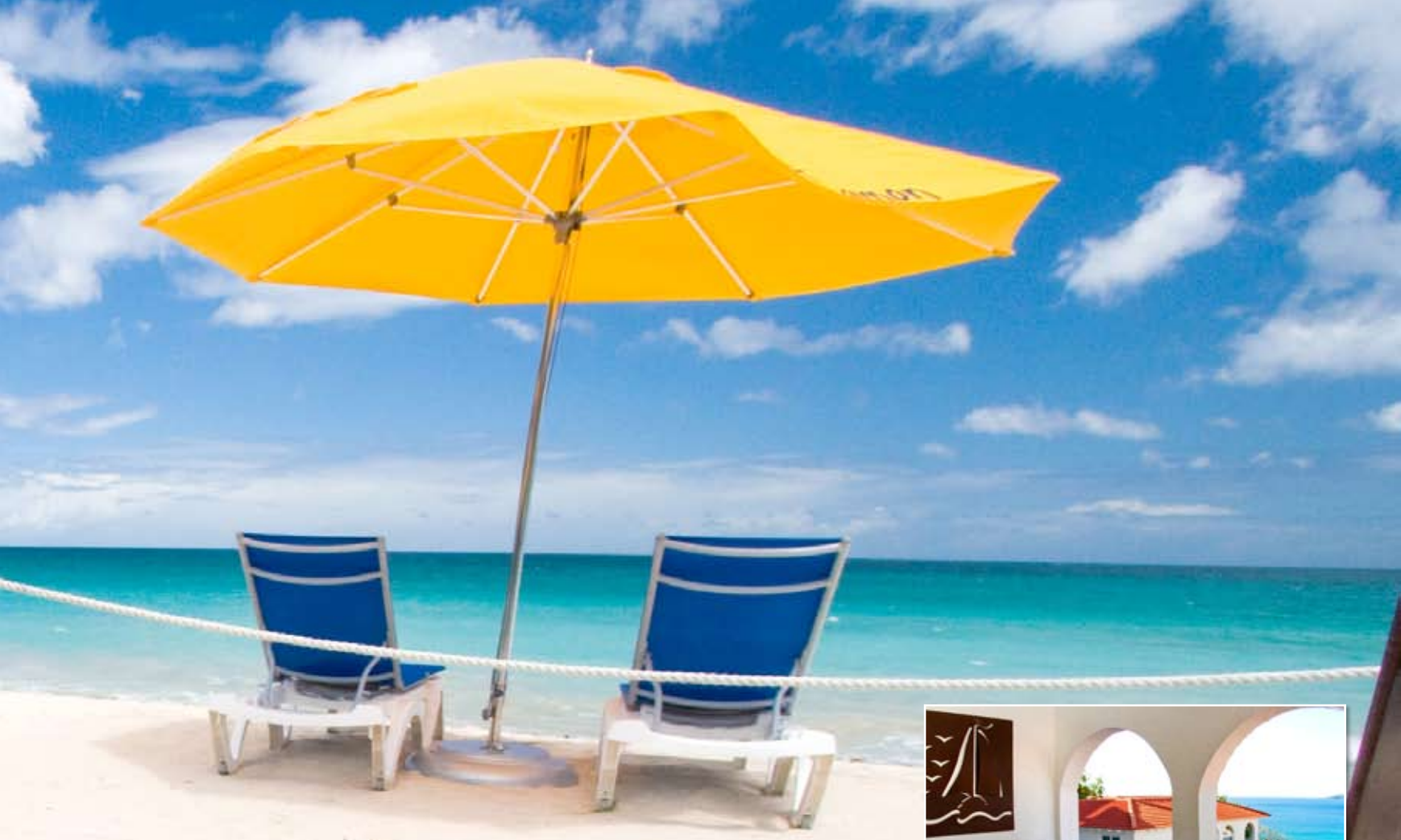
Right: The views at Mount Cinnamon are second to none. Below centre: Michael Douglas and Catherine Zeta Jones are recent visitors. Facing page inset: Grenada's gorgeous harbour capital of St George's