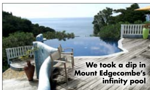
We took a dip in Mount Edgecombe's infinity pool

REPORT BY DANNY LEDGER EDITED BY ANNABEL MACKIE, OK! TRAVEL EDITOR